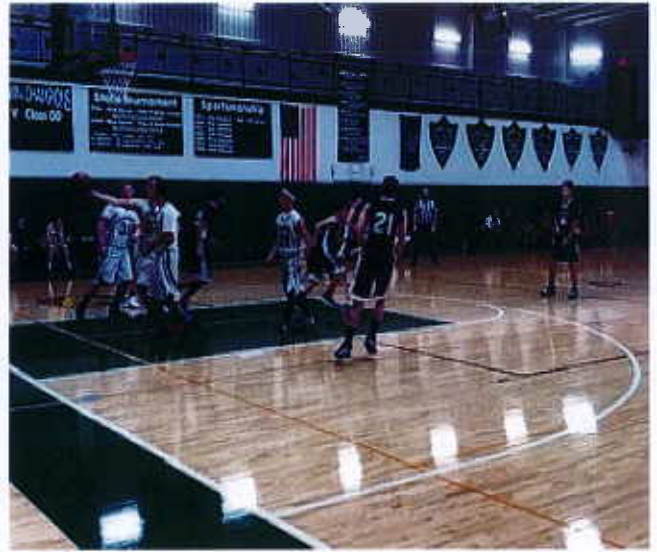
Boys JV Basketball