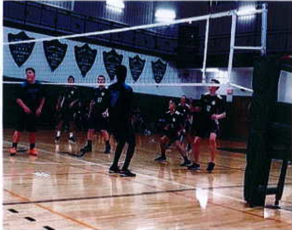
Our winter sports teams are off to a great start!