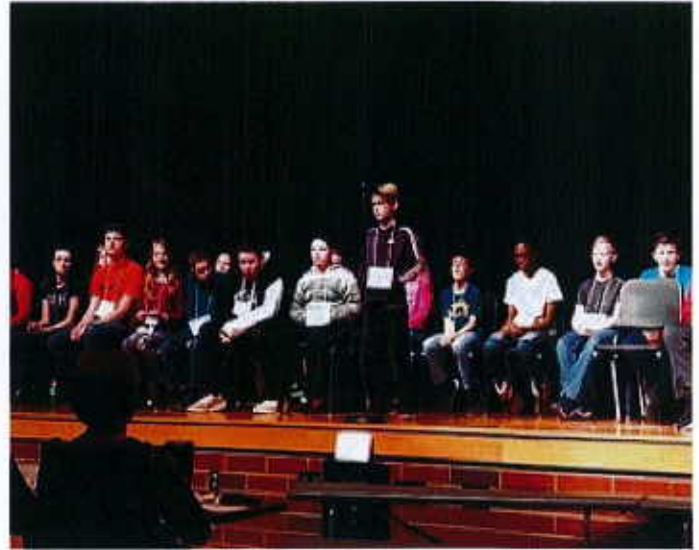
2018 Spelling Bee