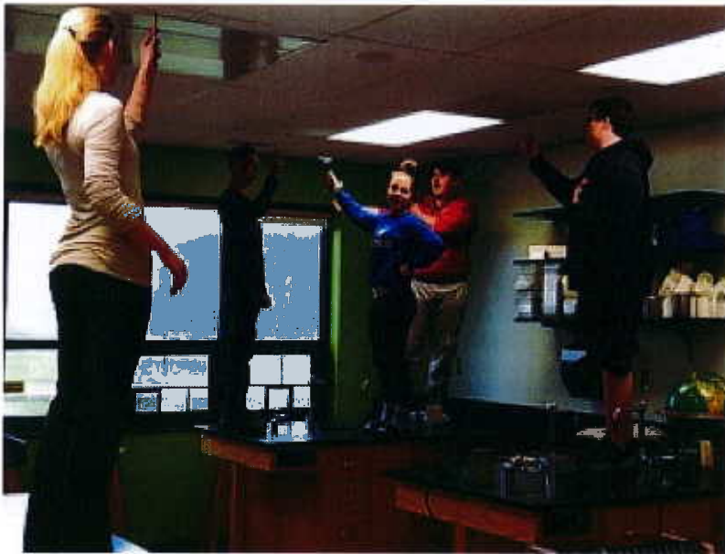
Mr. VanTassel's Earth Science class measured the relative humidity in different parts of their classroom, the hallway and outside.