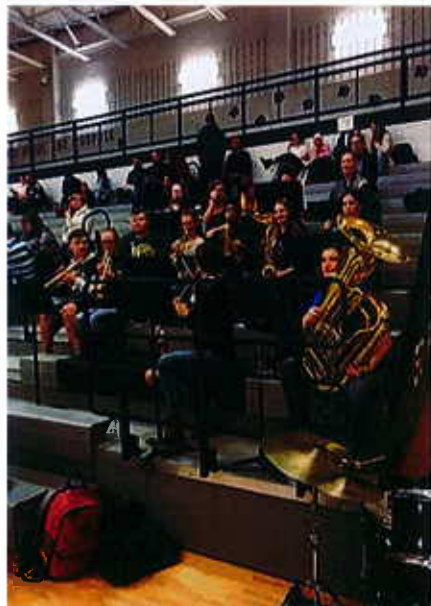
It is great to see the Pep Band supporting our athletes!