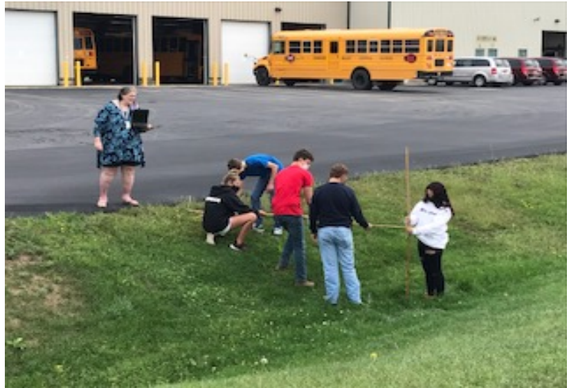
Students in Mrs. Bentley's Earth Science class measured ground temperature for a lab activity.